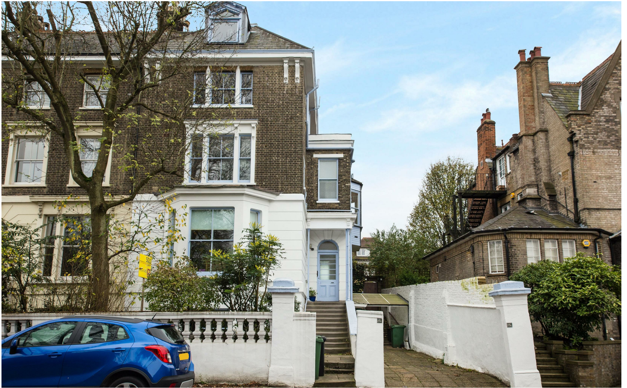
Hampstead Lane N6